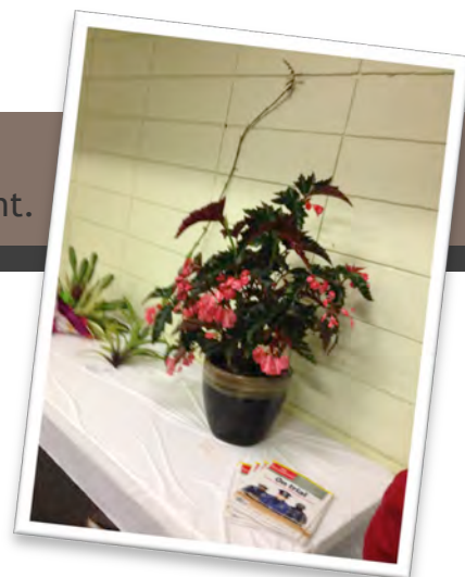
Thomas Dwyer's huge flowering begonia was the first selected gift plant.